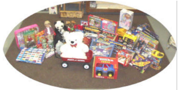
Look at all those toys!!!