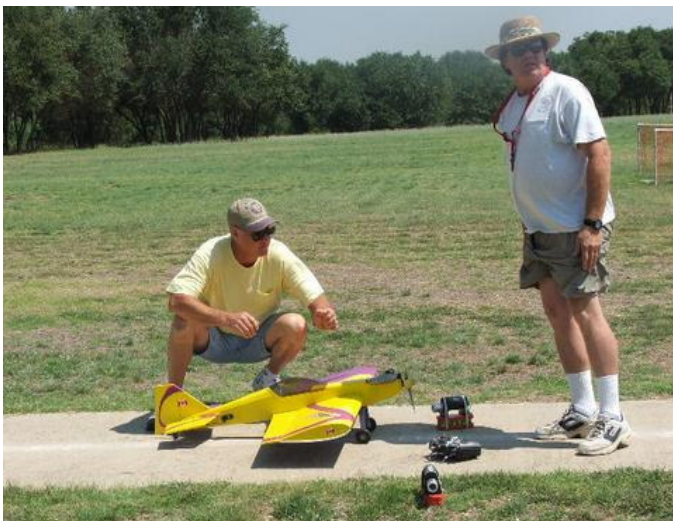
What form! Is this crew getting ready for a Fun Fly or a Pylon Racing event???