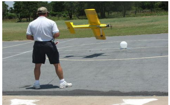
Anybody can pop a balloon with their prop – it takes a real man to only use a wingtip!