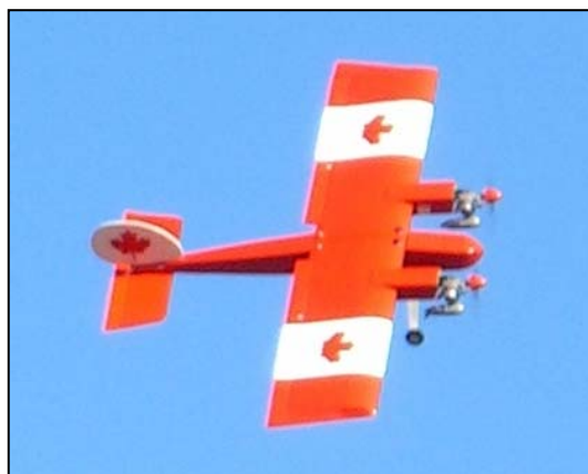
Doug's Canadian Twin in flight