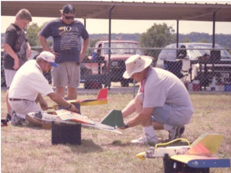
Getting ready for battle!