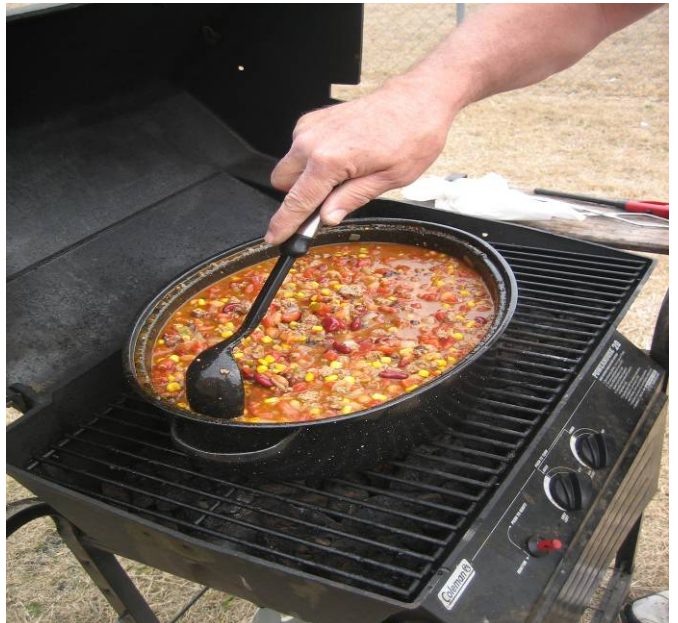
Larry's taco soup tasted even better than it looks!