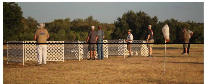
It was a busy day at the flying field!