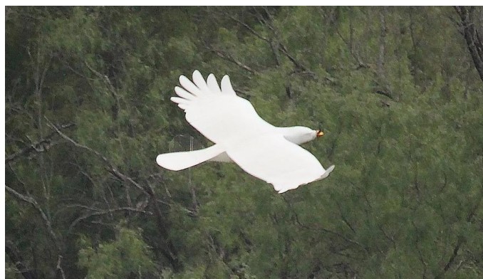
It looks realistic in the air!