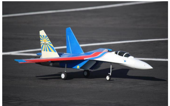
Charles Cehand's nice SU-27a is ready for takeoff.