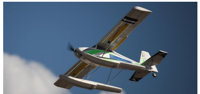
Who needs water for their float plane? JR Hester certainly doesn’t!