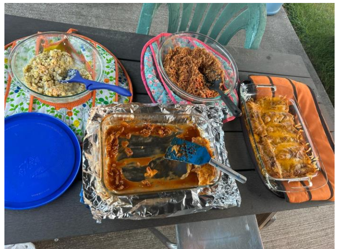
Marsha cooked up a delicious meal consisting of chicken enchiladas, Mexican rice and Mexican corn for our Night Fly that was held on September 19 th .