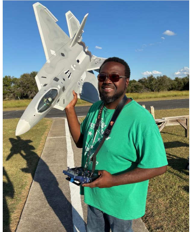
A visitor with a couple of really nice EDF jets came to visit us after our Fall Fun Fly, and put on quite an impressive show for us!