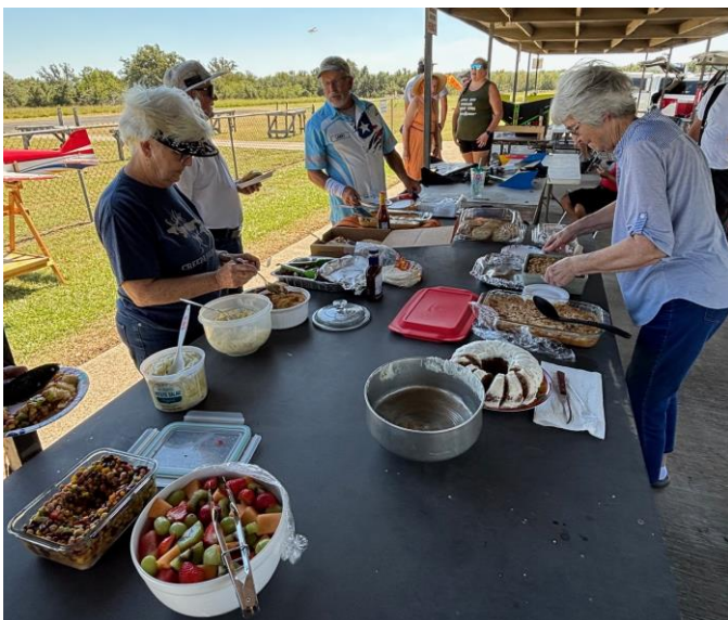
Preparing the table of goodies at our Fall Picnic.