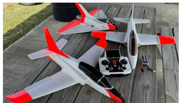
Chris B. decided to go proplless during a recent flying session.